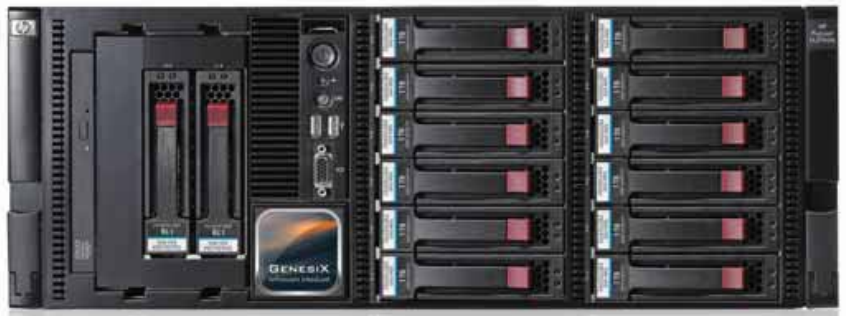
The full Genesis VideoServer provides everything needed to simply and flexibly operate a failsafe television station – from ingest and planning to playout, building on proven playout features

It builds on proven playout features (playout automation,